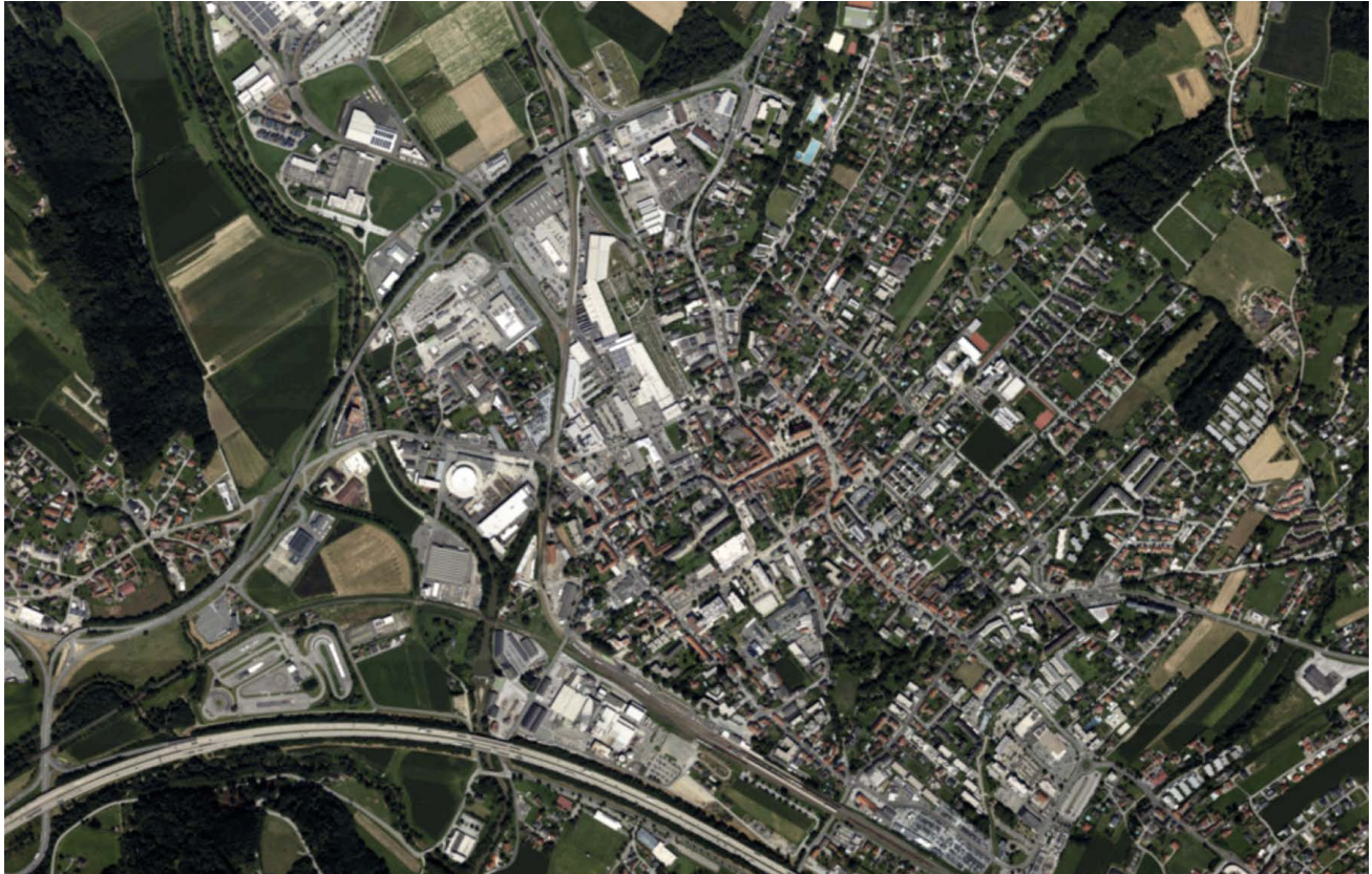
Fig 2: Image Block Overview - Orthomosaic

The test area (fast RTX region) is located in Austria near the city Graz. The data were collected with an image resolution of 5 cm (GSD). It consists of a small block of 40 images flown in 4 north-south strips. Ground control points (GCPs = 10) are spread over the area, referenced in ETRF00 frame at epoch Jan 1, 2000.