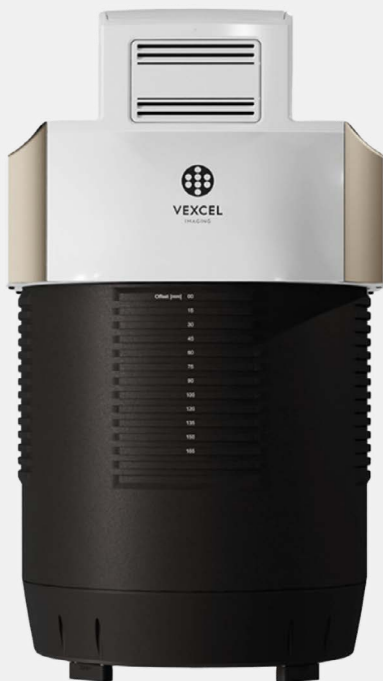
Fig 1: UltraCam Eagle

The newest IN-Fusion PP-RTX™ feature in POSPac version 9.1 no longer necessitates the uploading of trajectory data to the Cloud Server. RTX Correction data can now be logged either in real-time (APX & AP+ products) or acquired via an internet connection in POSPac minutes after data acquisition. The quality and performance of PP-RTX have significantly improved over the years, surpassing traditional post-processing modes. For detailed information and a comprehensive overview of all benefits, please refer to our PP-RTX website .